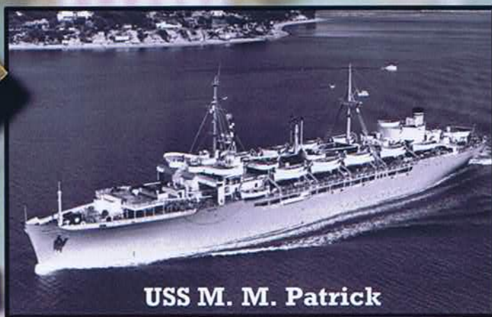
USS M. M. Patrick