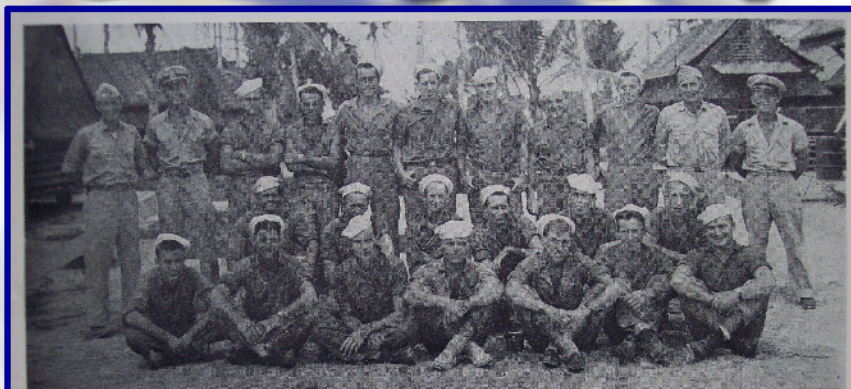
Company A, Platoon 4